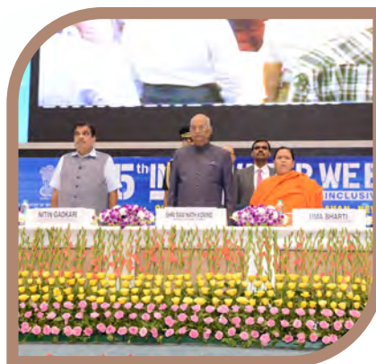
Water and Energy for Inclusive Growth