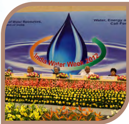
Water, Energy and Food Security: Call for Solutions