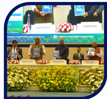
Water Cooperation – Coping with 21st Century Challenges