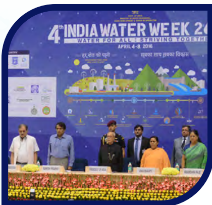
Water for All: Striving Together