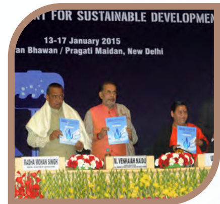
Water Management for Sustainable Development