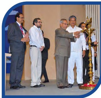
Efficient Water Management: Challenges and Opportunities