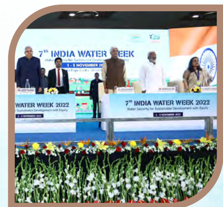
Water Security for Sustainable Development with Equity