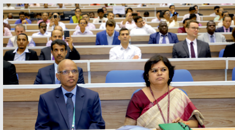
Participants at the 6 th India Water Week 2019.

More informed and comprehensive discussions about the management and conservation of water will be taking place throughout the 6th India Water Week.