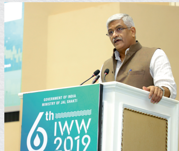
Shri Gajendra Singh Shekhawat delivering his address at the 6 th India Water Week 2019.

Rigveda saying, "Water has nectar like properties and possesses healing medicinal powers". He highlighted the aspect of considering water as a sacred commodity in the Indian culture and how it is a significant molecule in the field of science and spirituality.