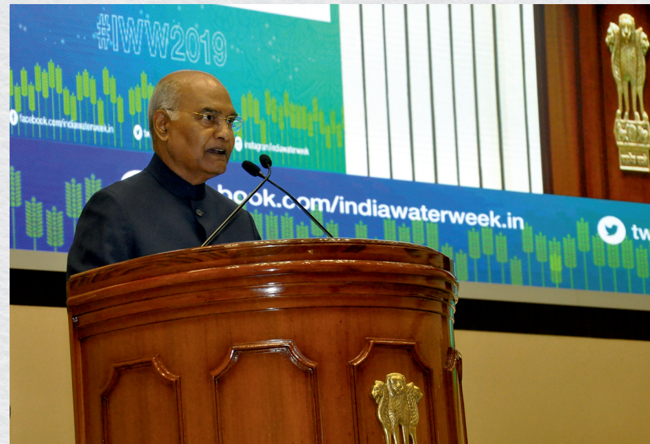
The Hon'ble President of India, Shri Ram Nath Kovind, delivering his address at the 6 th India Water Week 2019.

Rigveda saying, "Water has nectar like properties and possesses healing medicinal powers". He highlighted the aspect of considering water as a sacred commodity in the Indian culture and how it is a significant molecule in the field of science and spirituality.