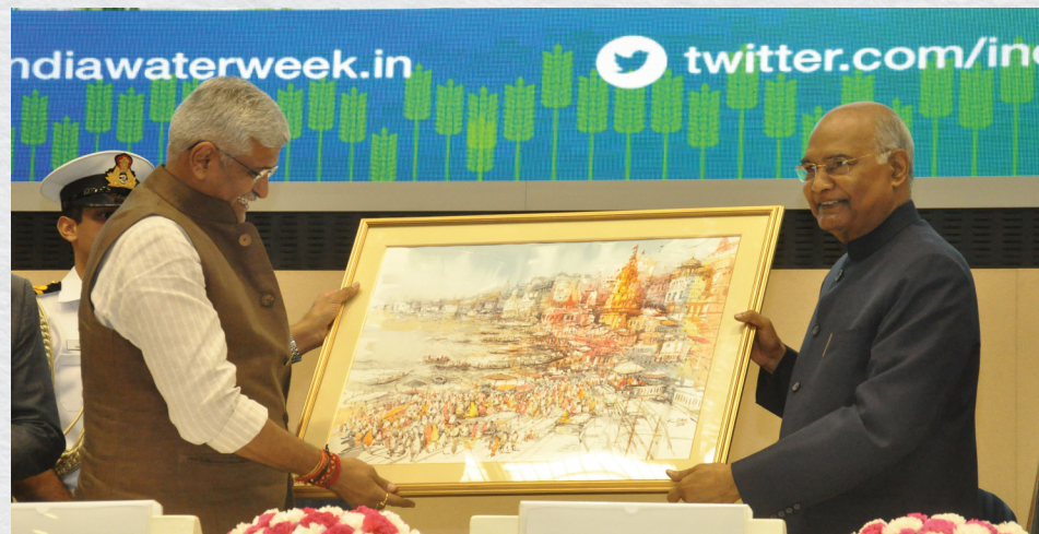
Shri Gajendra Singh Shekhawat felicitating the Hon'ble President of India, Shri Ram Nath Kovind

Shri Gajendra Singh Shekhawat in his inaugural address mentioned that India Water Week is a platform to gather and discuss possible ways to find solutions pertaining in the waters sector. He quoted the