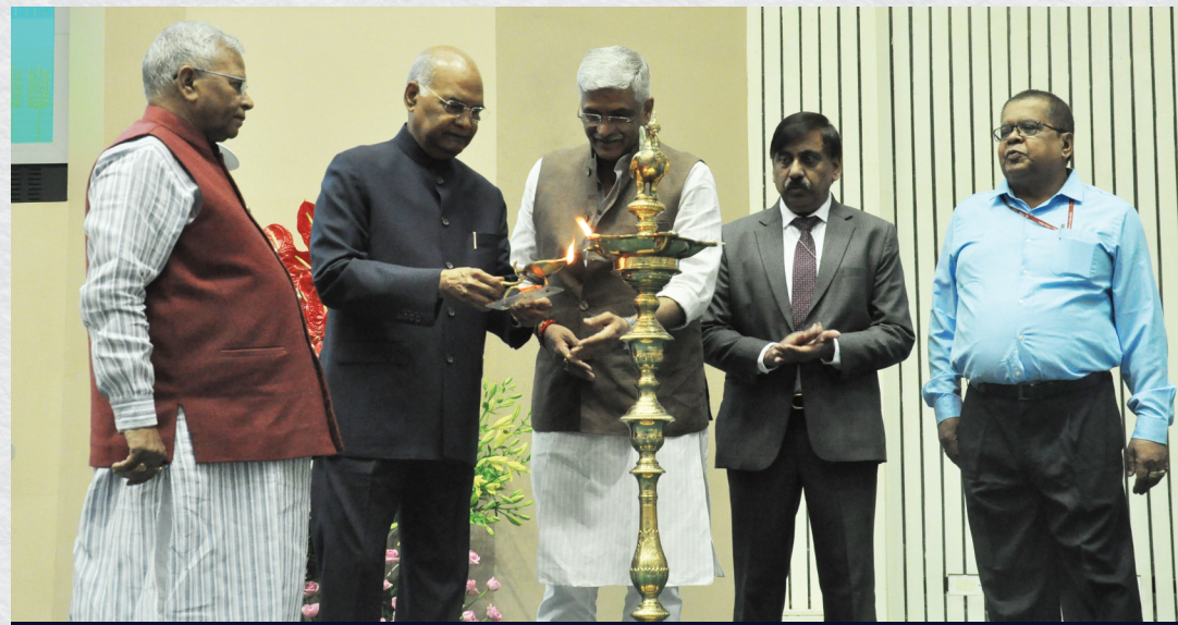
The Hon'ble President of India, Shri Ram Nath Kovind, inaugurated the 6 th India Water Week 2019.

President Kovind highlighted the aspect of 'Jal Jeevan Mission' and termed it bold and ambitious, as presently only 18% of rural Indian households get piped water. He informed that the mission will focus on integrated demand and supply side management of water at the local level and will create infrastructure for rainwater harvesting and groundwater recharge. He was confident that widespread participation of people will help the govt. achieve this goal. He also said that the PMKSY Yojana is a major initiative for farmers under the vision